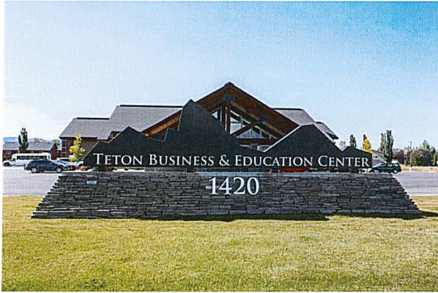
Figure 2: Altura Community Consulting & Business Finance